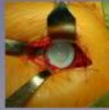
It's not possible to see the femoral head and acetabulum in the same picture. In this picture, the femoral head is visible. In the next picture, the acetabulum is visible. The femoral head is not visible in the next picture.