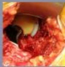
It's not possible to see the femoral head and acetabulum in the same picture. In this picture, the femoral head is visible. In the next picture, the acetabulum is visible. The femoral head is not visible in the next picture.