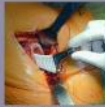
It's not possible to see the femoral head and acetabulum in the same picture. In this picture, the femoral head is visible. In the next picture, the acetabulum is visible. The femoral head is not visible in the next picture.