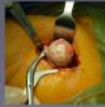
It's not possible to see the femoral head and acetabulum in the same picture. In this picture, the femoral head is visible. In the next picture, the acetabulum is visible. The femoral head is not visible in the next picture.