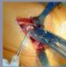
It's not possible to see the femoral head and acetabulum in the same picture. In this picture, the femoral head is visible. In the next picture, the acetabulum is visible. The femoral head is not visible in the next picture.