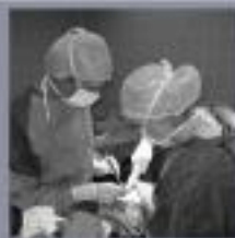
It's not possible to see the femoral head and acetabulum in the same picture. In this picture, the femoral head is visible. In the next picture, the acetabulum is visible. The femoral head is not visible in the next picture.